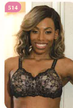
Princess Lace Bra