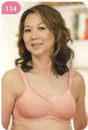
Satin Trim T-Shirt Bra