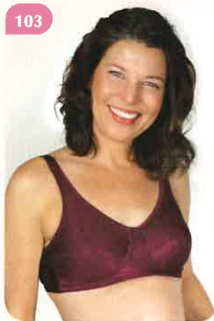
Rose Contour Bra